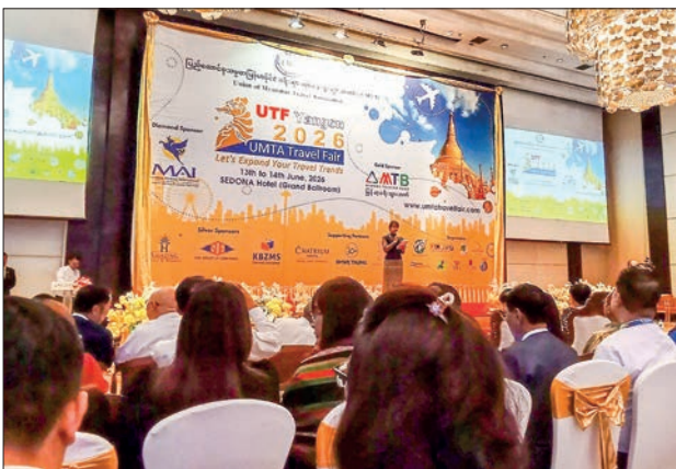
This image displays the opening ceremony of the UMTA Travel Fair 2026 at Yangon's Sedona Hotel on 13 June.

The country sets the foreign trade target depending on the condition of exports and imports. — ASH/KK