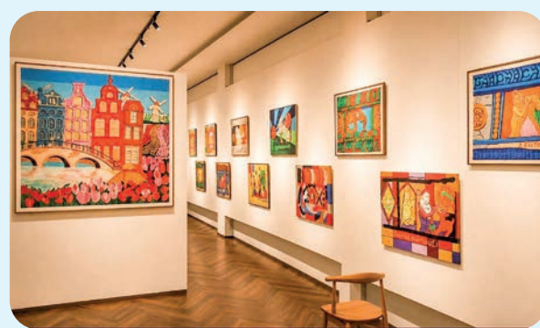
This photo captures paintings to be displayed in the exhibition.