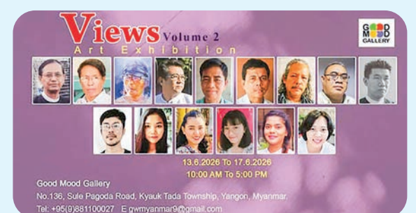
This image illustrates a catalogue for the 'Views' Volume 2 group art exhibition.