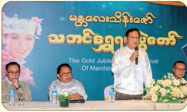
This image features the press briefing for the Thein Zaw Thabin Golden Jubilee Festival.