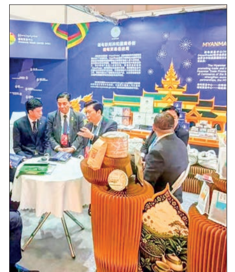
This image shows MFVP's five-day trip to China (Yunnan Province).

They also visited a high-tech "Premium Wholesale Market" for assessments aimed at securing a place for high-quality Myanmar fruits in the market. — MT/ZN