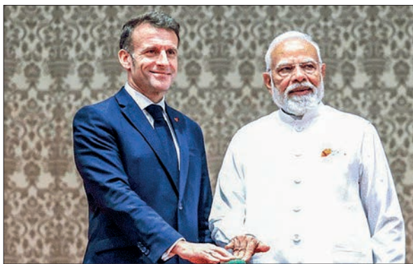
Earlier this year, President Macron visited India, and two countries elevated relationship to a Special Global Strategic Partnership.

In his departure statement, he highlight-