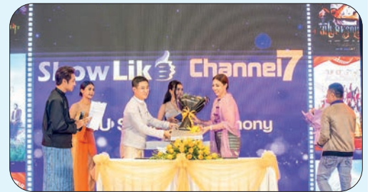
This image shows artistes attending the MOU signing ceremony of Show Like and Channel 7.

A responsible official from Show Like stated that through this collaboration, audiences will be able to enjoy higher-quality and more modern entertainment programmes in the future.