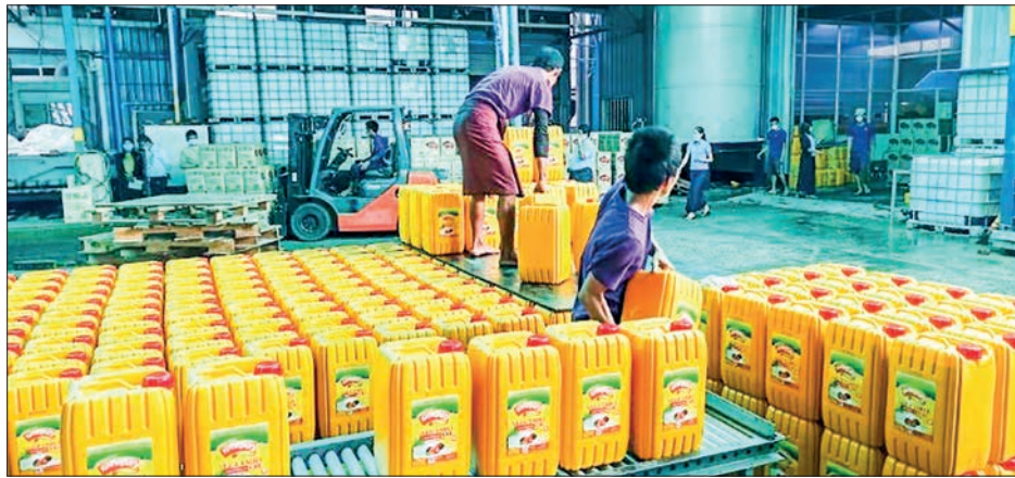
Oil mill workers are organizing cooking oil jerrycans for distribution and sale.

The Supervisory Committee on Edible Oil Import and Distribution under the Ministry of Commerce has been closely observing the FOB prices in Malaysia and Indonesia, adding transport costs, tariffs and banking services to decide the wholesale market reference rate for edible oil weekly. Despite the reference price, the market price is