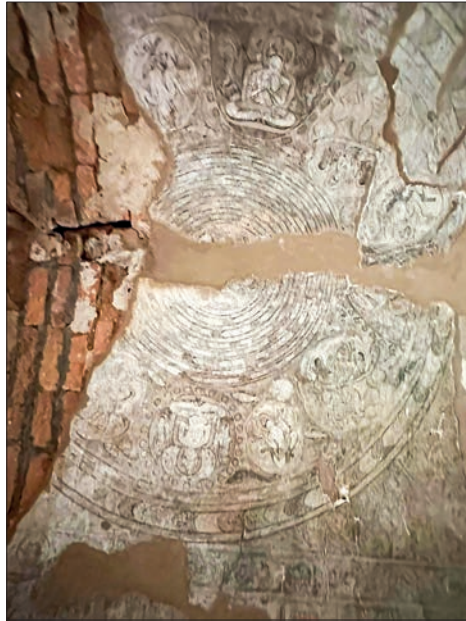
These photos feature captivating circular paintings, along with other paintings found inside the Ngaphone Thinyaung Temple.

Inside the temple, distinctive circular murals, along with various other paintings, can be seen, and these are believed to depict the structure of the universe and illustrate the teachings of the Lord Buddha as described in Buddhist scriptures.