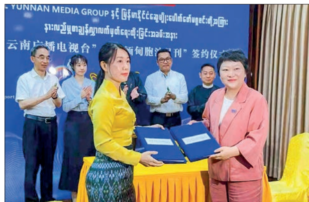
This image reveals the signing of the MoU between China's Yunnan Media Group and Myanmar's Swe Myo Pauk-Phaw Magazine.

A Memorandum of Understanding (MoU) signing ceremony was held in Yangon on 27 May, with