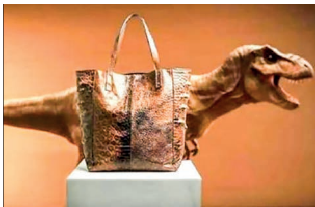
Unveiled in the spring in Amsterdam, the bag was created from traces of collagen from the femur of a T Rex found in the US state of Montana 25 years ago.

Giquello estimated the value at between 300,000 and 500,000 euros ($346,000 to $576,000). — AFP