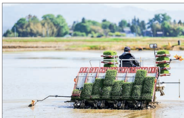
File photo taken on 2 May 2026, shows a farmer using a machine to plant rice in a paddy in Sanjo, Niigata Prefecture.

Under the consumption tax system, businesses deduct the tax they pay on purchases of goods such as fertilizers and agricultural machinery from the tax they collect on sales of their products, then remit the difference to the government. — Kyodo