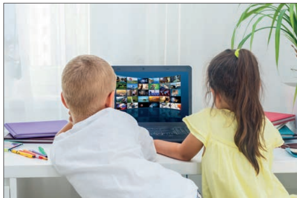
The proposed Digital Safety Act makes Canada the latest in a wave of countries cracking down on social media platforms over concerns of harm to children.

Social media services, including adult content platforms, would also face new requirements under the law to "mitigate risks associated with exposure" to various categories of harmful content and apply labels to synthetically generated content. — AFP