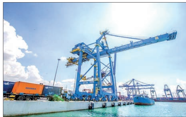
Photo taken on 24 January 2022 shows a view of the Laem Chabang Port in Chonburi Province, Thailand.

Sihasak, who also serves as Thailand's deputy prime minister, expressed support for Japanese Prime Minister Sanae Takaichi's Partnership on Wide Energy and Resources Resilience Asia, a Japanese-led financing framework designed to help Asian countries secure stable oil supplies, the foreign ministry said. — Kyodo