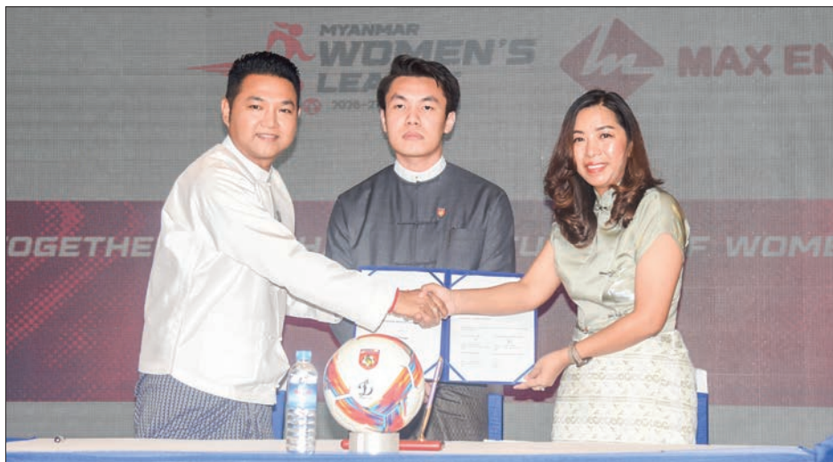
An official signing ceremony for the Myanmar Women's League 2026-27 is in progress on 11 June 2026.

formance-based ranking subsidy ranging from K100 million for the champions down to K7.5 million for the tenth-place team. Individual match incentives also received a boost, with the AYA Pay Player of the Match prize increasing to K500,000 per game. The new season kicks off on