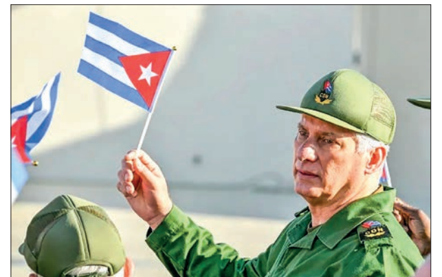
Cuba's President Miguel Diaz-Canel says the country will open more sectors to private businesses as it seeks to liberalize its communist-run economy.