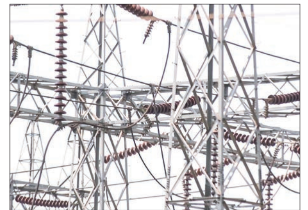
Electricity transmission facility.

OF the country's annual power generation, about 18.38 per cent or about 3,559 million units of electricity, has been lost, said the Ministry of Electricity and Energy on 11 June, and it also urged the public to report electricity theft.