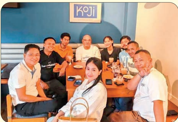
Members discuss the performance of Win Thabyay Tun Anyeint.