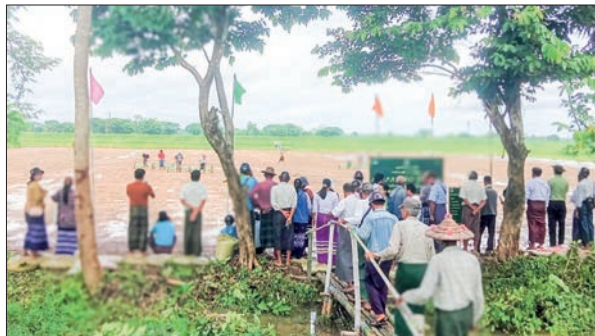
A drum seeder demonstration is underway in Hinthada Township.

A drum seeder demonstration and handover of MPE fertilizer was con-