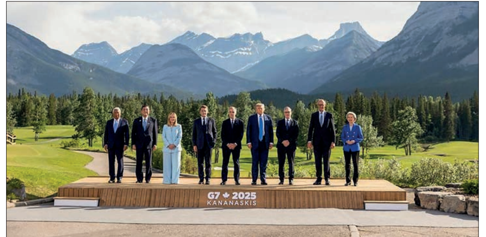
The Group of Seven (G7) and Europe Union leaders pose for a group photo in Kananaskis in the province of Alberta, Canada, 16 June 2025.

The summit will bring together leaders from Britain, Canada, France, Germany, Italy, Japan and the United States, as well as the European Union (EU), to discuss responses to