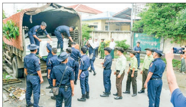
Departmental personnel carry the textbooks and exercise books to the District Education Office in Myitkyina yesterday.

The Northern Command commander and state ministers inspected the delivery of Ministry of Education school textbooks and exercise books to the District Education Office,