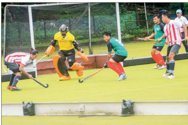
The final match between Yangon City FC and Lion City FC is in action at the Men's Hockey Tournament.

YANGON City FC clinched the championship title at the 2026 Yangon Region Government Chief Minister's Cup 5-A-Side Men's Hockey Tournament after defeating Lion City FC with a 7-4 victory in the final match held yesterday evening at the Theinbyu Artificial Turf Hockey Pitch.