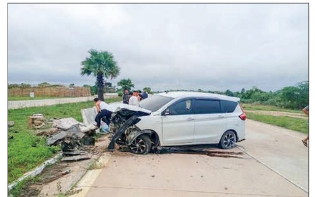
This photo captures an accident that occurred on the expressway.

Furthermore, the Expressway Maintenance and Supervision Committee has warned that all vehicles using the expressway must observe the speed limit, avoid following too closely, and maintain a distance of at least