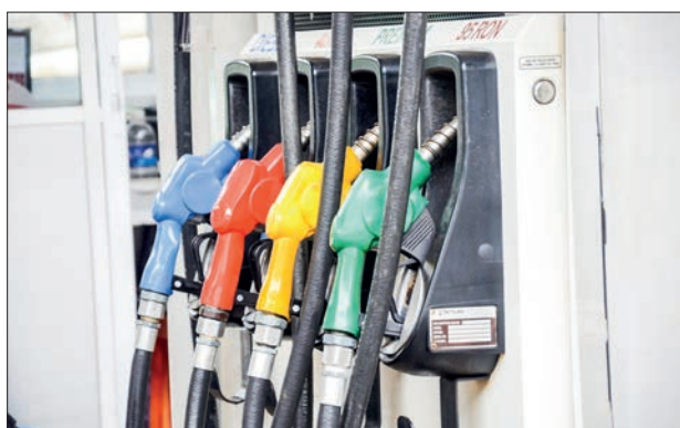
As per the statement, 90 per cent of fuel oil in Myanmar is imported, while the remaining 10 per cent is produced locally. A pump machine at a petrol station.

The committee is governing the market to ensure a stable price and