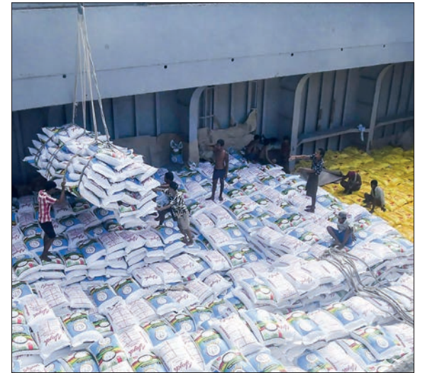
Workers load export cargo into the hull of an overseas-going merchant vessel.

Myanmar will endeavour to achieve $15.3 billion in exports and $14.7 billion in imports in the current financial year. Furthermore, Myanmar's foreign