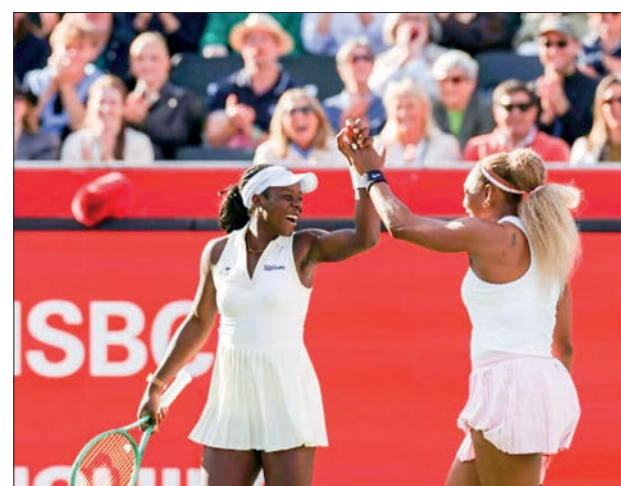
Canadian Victoria Mboko hopes to resume her doubles partnership with Serena Williams after she recovers from a knee injury.

Williams, a 23-time Grand Slam singles champion, is now gearing up for the Berlin Open, where she is reportedly set to play alongside Karolina Muchova.