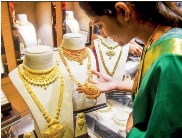
JP Morgan sees gold touching $6,000/per ounce by end-2026 despite recent price cooling.

JP Morgan Global Research analysts estimate that gold prices could reach new record highs by 2026-end, to around $6,000 per ounce in Q4, with upside seen near $6,300 per ounce in 2027, ANI reported. The forecast comes despite recent weakness in investor interest and a period of sideways trading, it added.