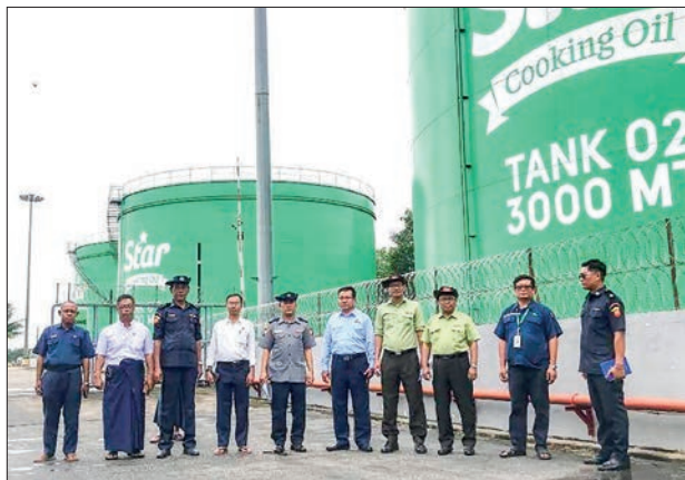
Officials from the combined inspection team are seen during the field inspection of palm oil storage tanks.

The team included officials from the district-level General Administration Department, the Myanmar Police Force, the Fire Services Department, the Yangon City Development Committee, the Electricity Supply Corporation, and