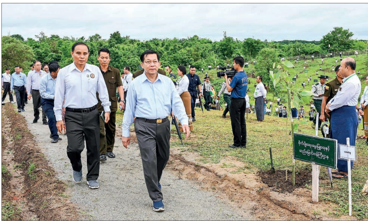
President of the Republic of the Union of Myanmar U Min Aung Hlaing views the tree planting of participants in the first monsoon tree-planting event yesterday in Nay Pyi Taw.

He noted that tree planting and forest con-