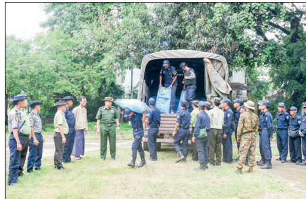
Rehabilitation supplies arrive in Mohnyin.

Heads of relevant district and township departments welcomed the arrival of the fertilizer. Tatmadaw members, staff from the General Administration Department, Myanmar Police Force personnel, firefighters, other officials, and residents assisted in