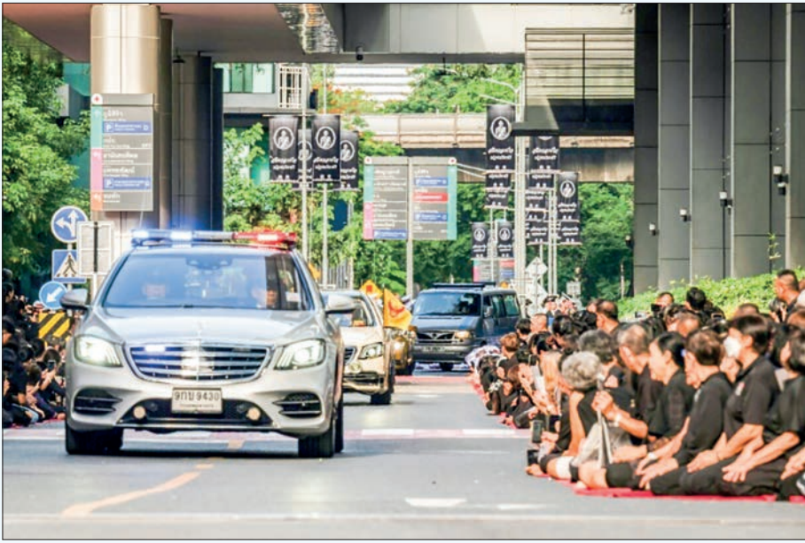
Mourners line the road outside Chulalongkorn Hospital to pay respects to Thai Princess Bajrakitiyabha Mahidol as her body is transported to the Grand Palace, where funeral rites will begin for the late princess, in Bangkok on 13 June 2026.