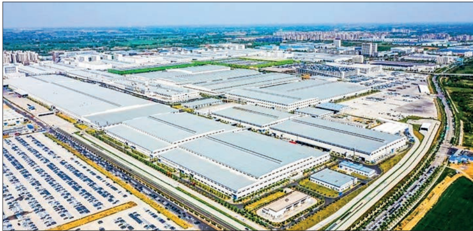
An undated aerial file photo shows a view of Xiatang Township, Changfeng County of Hefei, east China's Anhui Province.

A popular local saying captures the transformation of this small township in Changfeng County in Hefei, capital of Anhui Province: In the past, one sesame seed cake was made every one minute. Today, one NEV