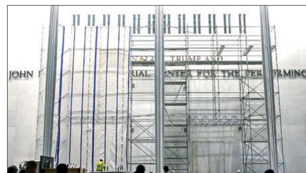
Workers build scaffolding and hang flame retardant tarps near the signage for the “Donald J Trump and John F Kennedy Memorial Centre for the Performing Arts” in Washington, DC, early on 13 June 2026.

Trump's name must be removed from the building by Friday midnight.